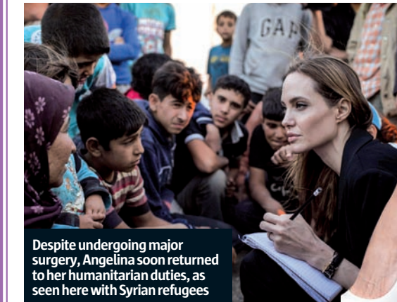
Despite undergoing major surgery, Angelina soon returned to her humanitarian duties, as seen here with Syrian refugees

"For any woman reading this, I hope it helps to know you have options," she said. "I want to encourage every woman, especially if you have a family history of breast or ovarian cancer, to seek out the information and medical experts who can help you through this aspect of your life and to make your own informed choices." And it hasn't been in vain – not only has she potentially saved her own life, but she's also saved thousands of others, as doctors report a dramatic rise in women being tested for the gene.