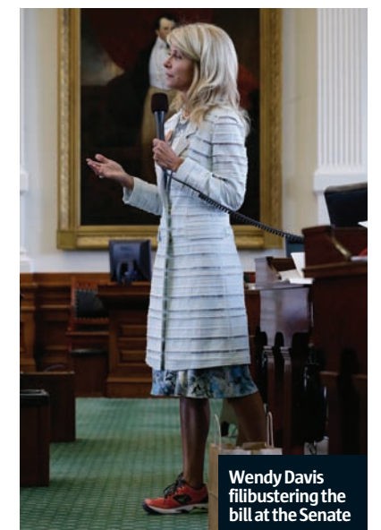
Wendy Davis filibustering the bill at the Senate