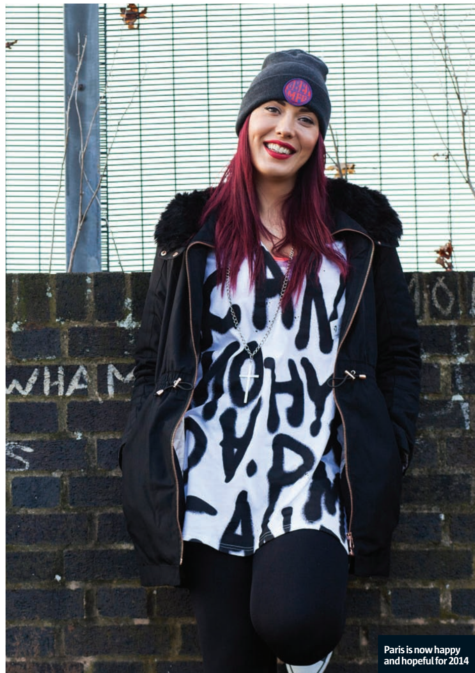
Paris is now happy and hopeful for 2014